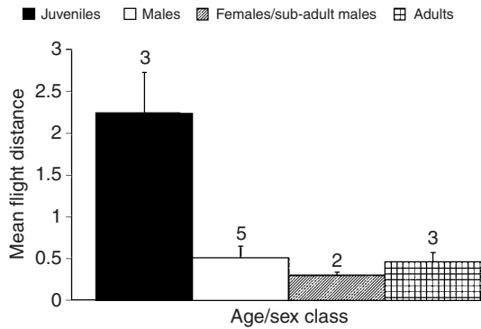
Fig. 3. Mean flight distance ( \pm 1 SE), defined as the distance Platysaurus intermedius wilhelmi fled from an initial stationary position, because of an approaching investigator, to the point at which it stopped moving, by age–sex class (see text for details). Sample sizes are above each bar.

ran further from an approaching human than either adult group ( P < 0.05 ).