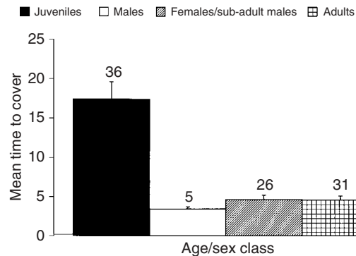
Fig. 2. Mean time to cover ( \pm 1 SE), defined as the time Platysaurus intermedius wilhelmi took to take refuge after first detecting the investigator, by age–sex class (see text for details). Sample sizes are above each bar.

strongly dependent on age–sex class ( H = 31.89 , n = 67 , P < 0.0001 ; Fig. 2). Adults (males and females/sub-adult males) took a similar amount of time to seek refuge ( P > 0.05 ), while juveniles took much longer ( P < 0.05 ). When the same analysis was repeated for only those lizards which had a choice in refuge (rock vs vegetation), the analysis held at the same level of significance.