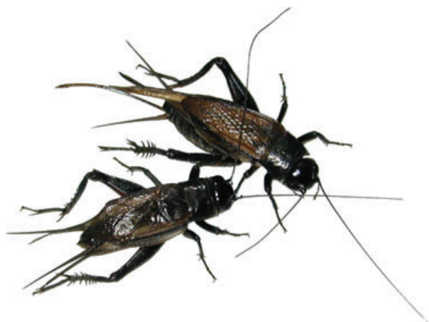
Figure 1. A male (bottom) and a female (top) black field cricket, Teleogryllus commodus .

We used a 2 \times 2 \times 2 design, in which we manipulated diet (two levels) and mating status (two levels) in both males and females, resulting in four treatments: diet C/virgin (CV), diet C/mated (CM), diet P/virgin (PV), diet P/mated (PM). We manipulated resource acquisition by providing experimental crickets with one of two artificial diets. Diet C was rich in carbohydrates, with a protein-to-carbohydrate ratio (P:C) of 1:8. Diet P contained equal amounts of protein and carbohydrates. (The exact percentages of dietary components were 9.33:74.66 P:C for diet C, and 42:42 for diet P, both adding up to the same protein and carbohydrate content of 84% in each diet. The remaining 16% consisted of indigestible crystalline cellulose.) We made artificial diets according to an established protocol (Simpson and Abisgold 1985).